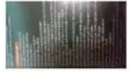
Phoenix f18 90mm edf jet