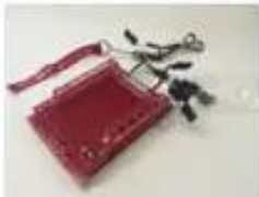
Smart-fly bits & pieces