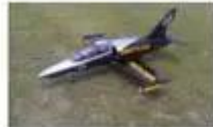
L39 Turbine Jet