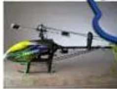
Trex 600 Fly-bar