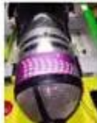
Jetcat 140rx Turbine